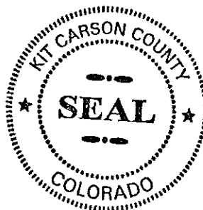
Democrat Canvass Member